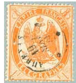
Figure 3. French telegraph stamp of 1868.