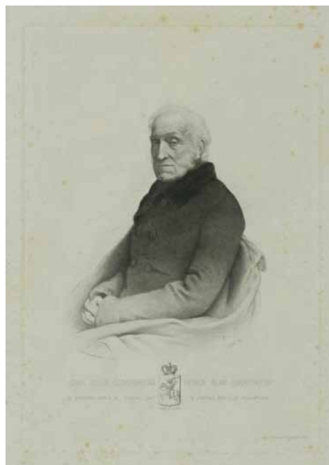
Figure 5. Bour, Cours de Mécanique et Machines, 1865. Figure 6. Adam Jerzy Czartoryski 1860.

Dulos produced a great variety of engravings including not only illustrations of light spectra and chemical equipment, but also images from “architecture, portraiture, the decorative arts, and even commercial advertising.” 24 See Figures 5 and 6 for examples. He also engraved topographic maps for the French Ministry of War and the Harbour Commission. 25 In recognition for that work he was made a Chevalier de la Légion d’Honneur in 1867. 26 Dulos was, Hentschel tells us, “one of the most highly skilled technical engravers of his time.” 27