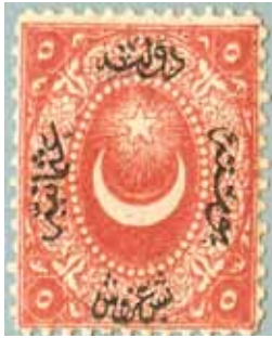
Figure 1. Ottoman stamp 1865