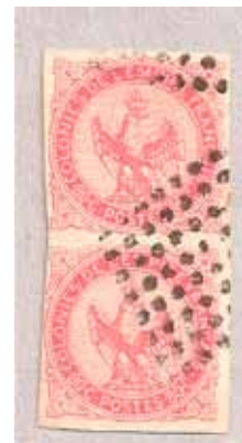
Figure 4. French Colonies stamps of 1859–65.