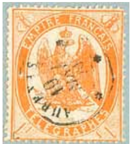
Figure 3. French telegraph stamp of 1868.