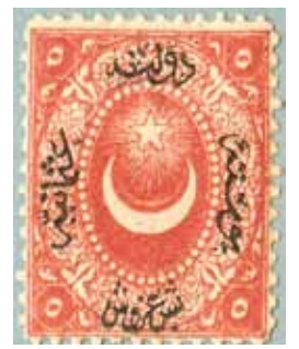
Figure 1. Ottoman stamp 1865

The Ottoman Empire issued its second design of stamps, commonly known as the "Duloz" stamp, beginning in 1865 (Figure 1). According to Max Passer, the Turkish Ministry of Finance designed the stamp but the die was engraved by a M. Duloz, a Frenchman, and the Poitevin firm in Paris printed the stamps by typography.<sup>4</sup> Passer