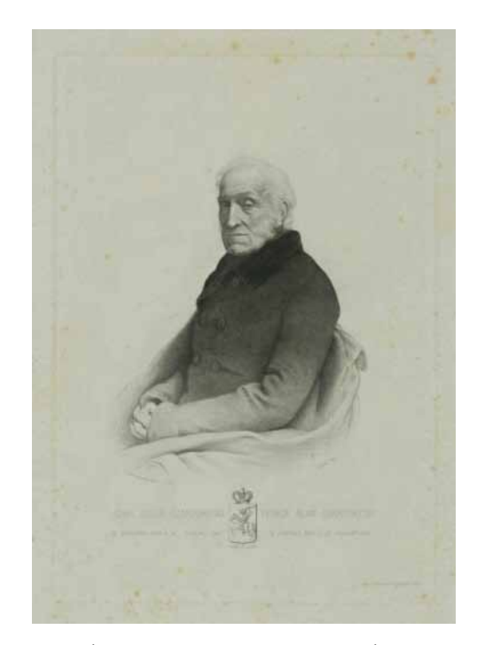
Figure 5. Bour, Cours de Mécanique et Machines, 1865.